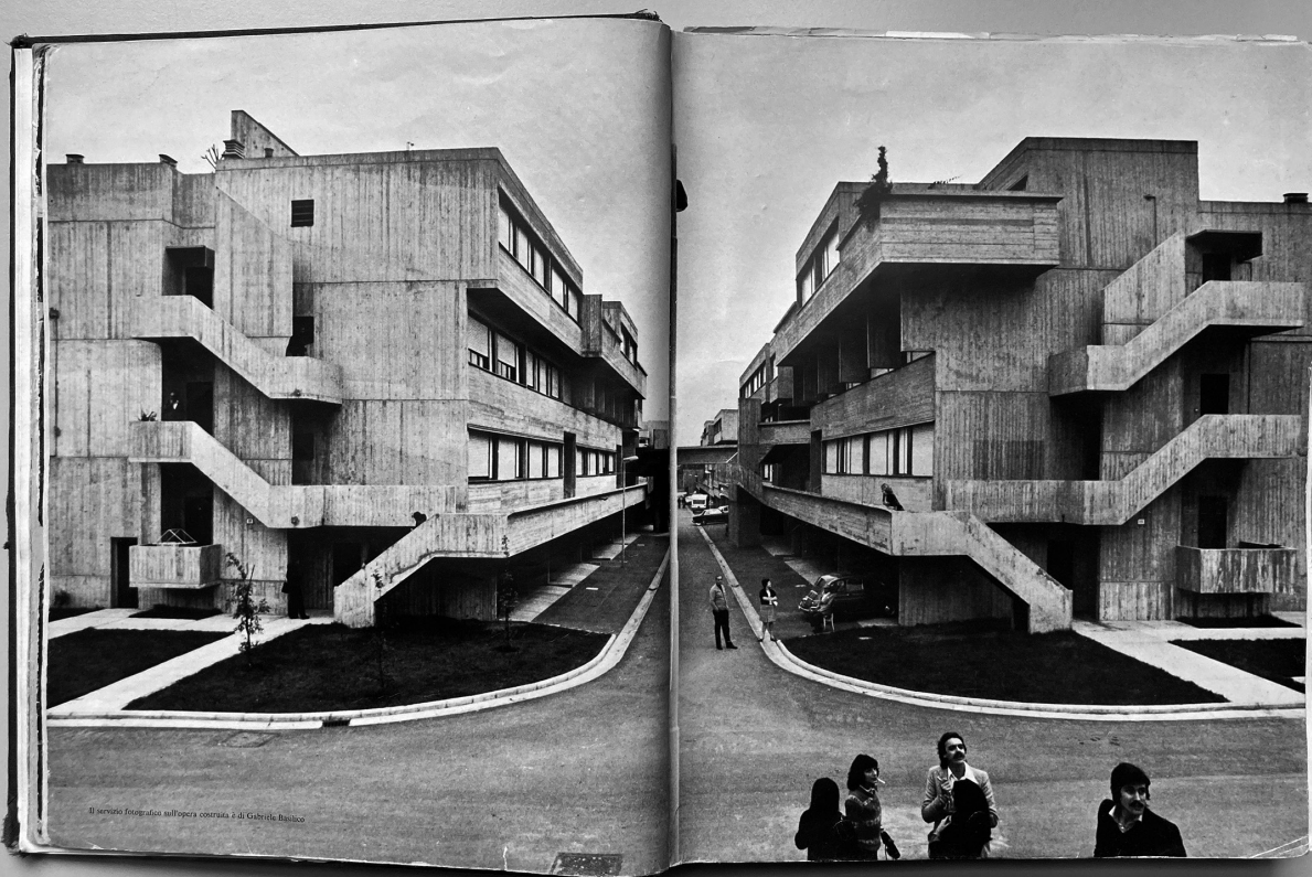
Fig. 1 - The Villaggio Matteotti in the two-pages photo by Gabriele Basilico published in the special section of "Casabella" dedicated to the complex. The image offers an inward-looking representation of the scheme, focused on the newly built public spaces and on the social life within them. Source: De Carlo et al., 1977: 24-25.