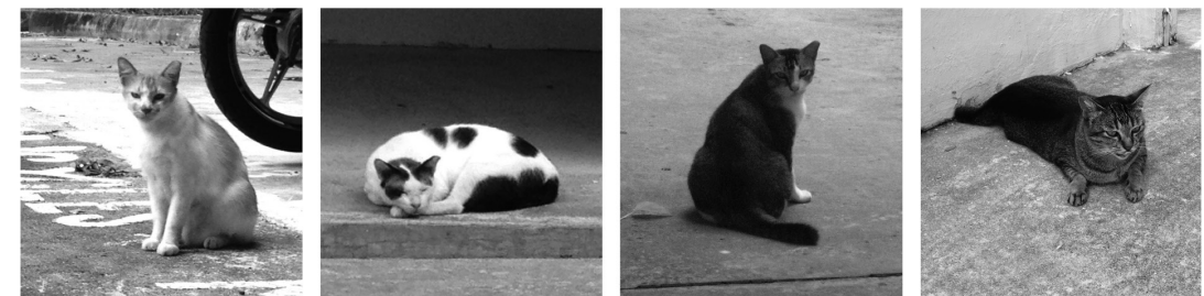
Fig. 4 - excerpt from the HABIT@AT project report.