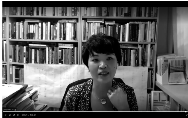
Fig. 1 - no caption

respond (Odell, Whiting, 2021). In her foreword, Whiting expresses that Odell's talk drew each person attending the event inward to identify "our individual roles in defining our attitudes, our roles, and our possibilities" (Whiting, 2021). How do we meaningfully discuss competency in a world overturned by a pandemic and systemic exclusion? In conversation with Seng, Whiting and Ho deliberate on the challenges and changing expectations on competency in architectural education and practice amid the latency of the historical moment.